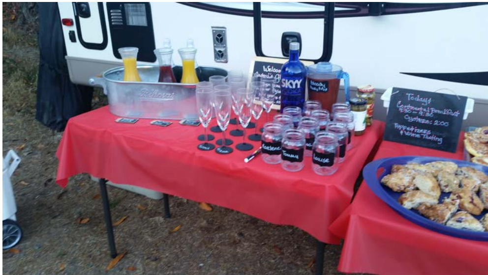
Hosts Even Provided Individual Monogrammed Glasses!!