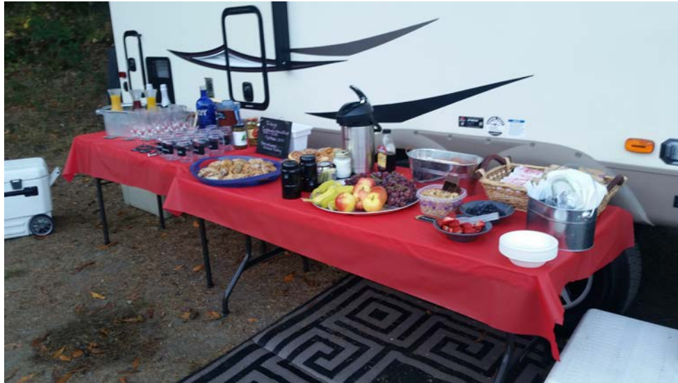
Who Could Ask for Anything More? – And This is Just Breakfast!