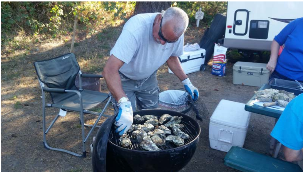
Look At Those Oysters! Fantastic!