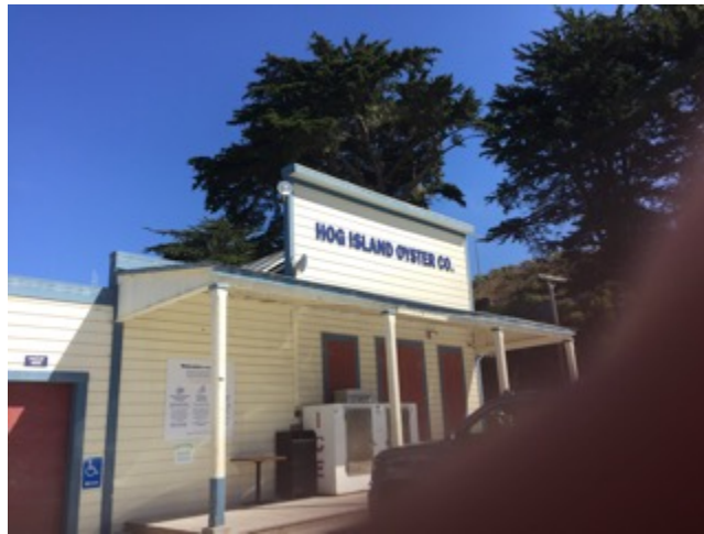
Hog Island Oyster Company