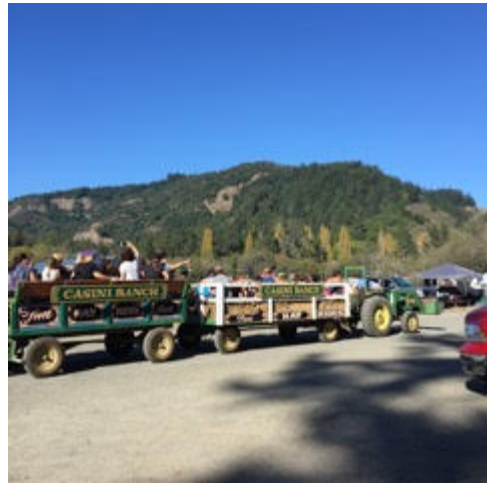
By The Campfire ----- Here Comes the Hay Wagon!