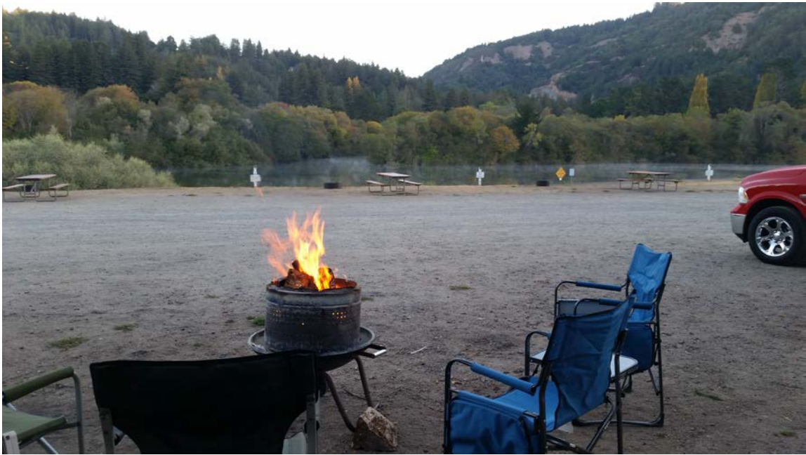
What A View!