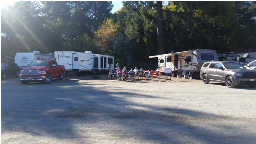
Huge Camping Space For the Bums!