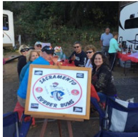
Just Sitting Around and Enjoying Ourselves!